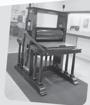
The printing press